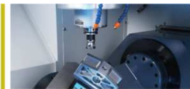
Machining centers in portal design

FEHLMANN cutting-edge technology «Made in Switzerland» - convince yourself!